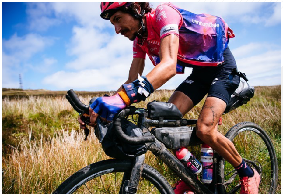
Lachlan Morton and his full self-supported setup

EF Education-NIPPO pro cyclist Lachlan Morton from Australia decided to go back in time. Back to the long days in the saddle, without team cars to hand him food or drinks, fully unsupported.