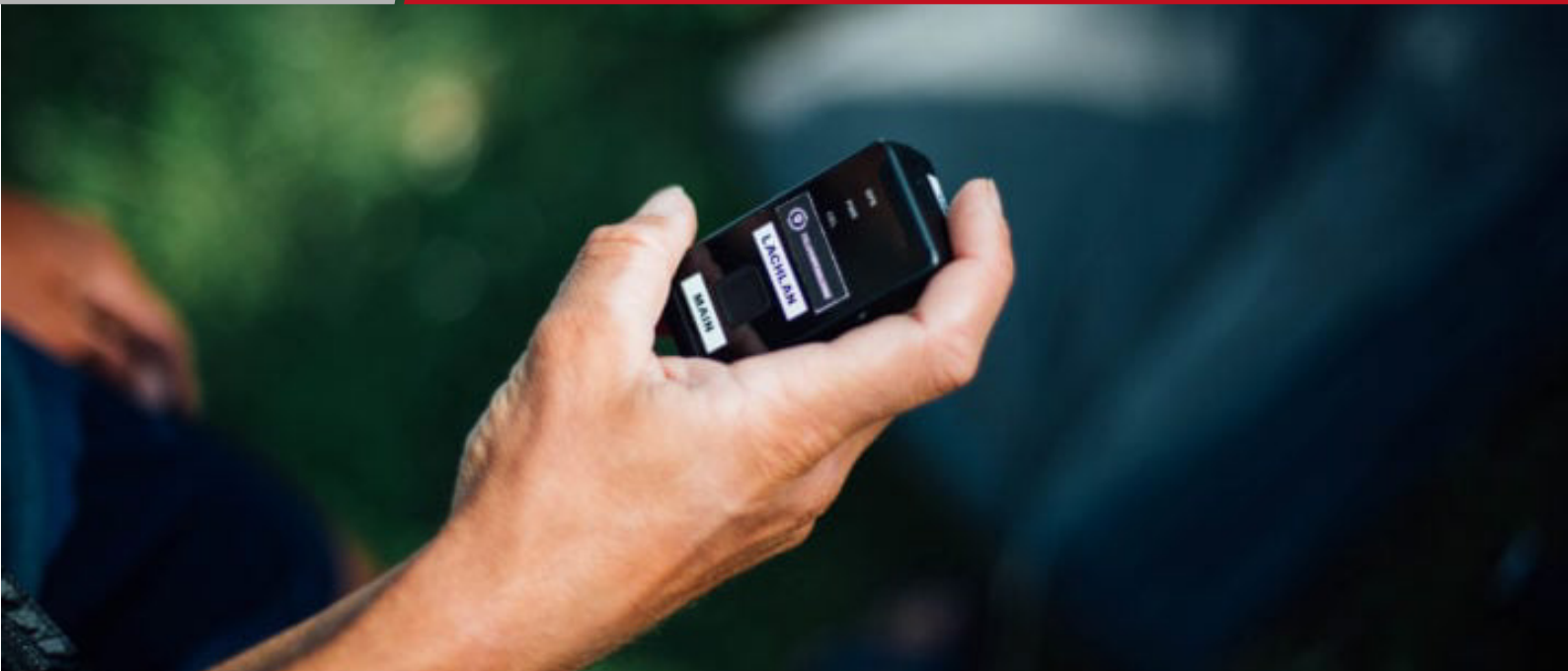
Queclink's GL300 series

Follow My Challenge chose the Queclink's GL300 series for this specific challenge mainly because of its capability to use the LTE-M network in France. This LTE-M network guarantees great coverage, especially in combination with the device's 2G fallback and M2M SIM.