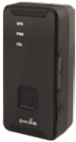
Queclink GL300 series